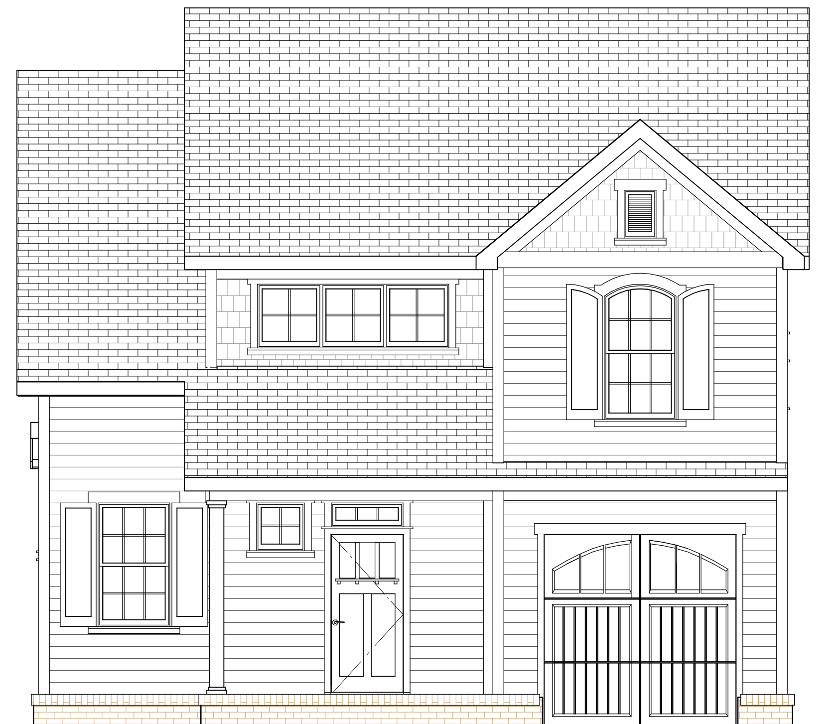
Front Elevation: Scale 1/4"