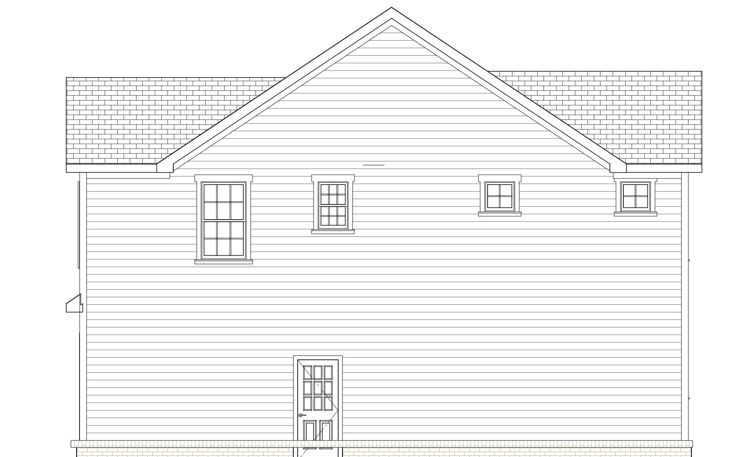
Right Elevation: Scale 1/4"