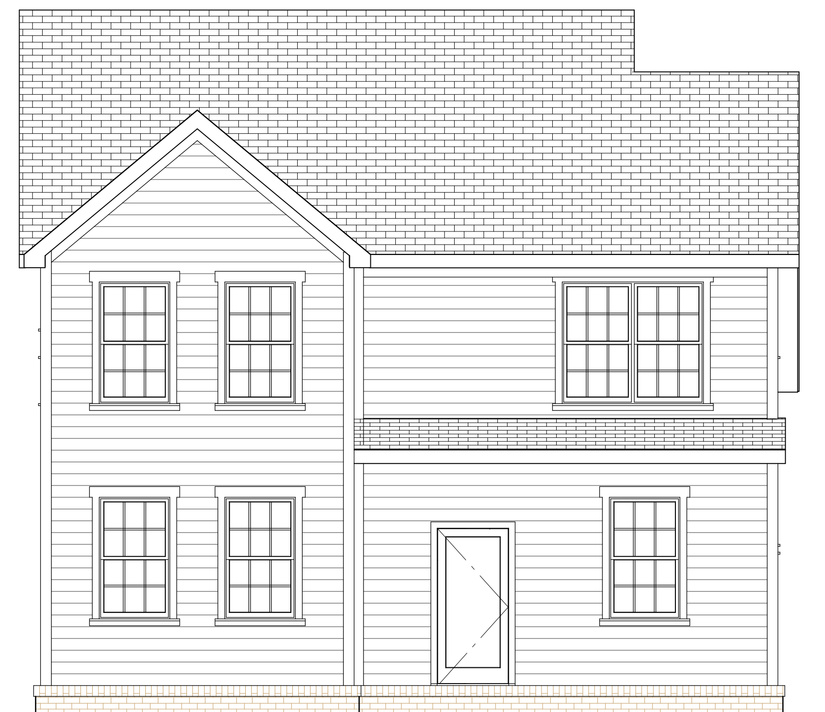
Rear Elevation: Scale 1/4"