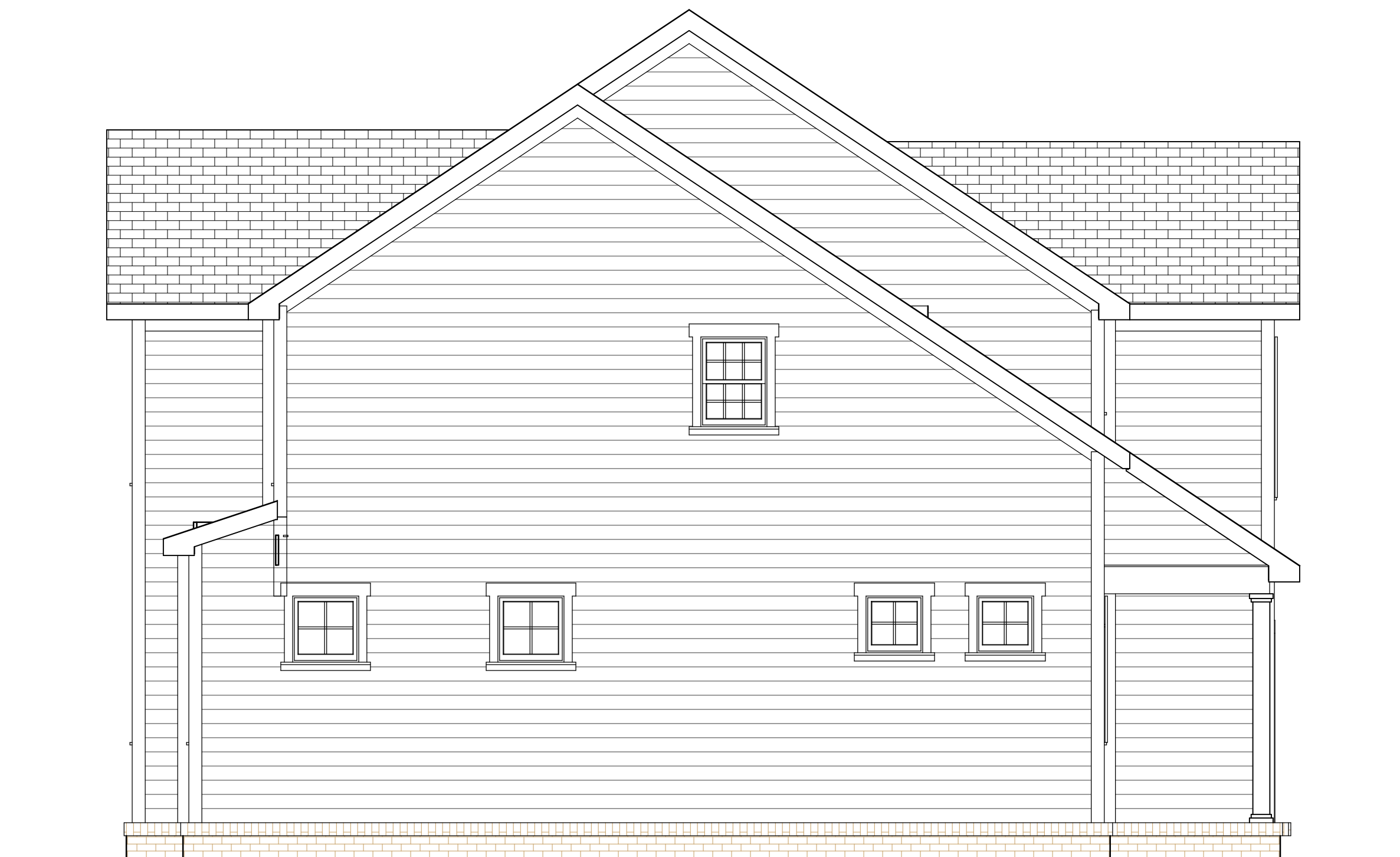
Left Elevation: Scale 1/4"